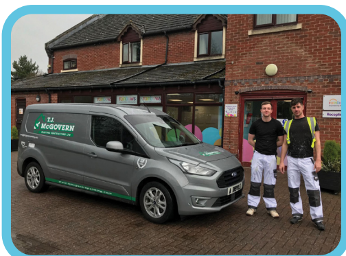
T.J. McGovern Painting Contractors

Our Music Room was recently revamped thanks to volunteers from T.J. McGovern Painting Contractors and Redrow Homes who worked hard over the course of a few days to give the room a well-needed lick of paint. Thank you also to Crown Paints in Nottingham for supplying the paint, you are all brilliant!